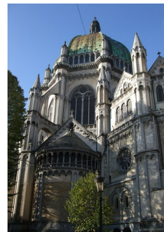
St. Mary's Royal Church in Schaerbeek.