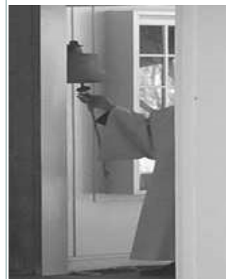
Call to Prayer