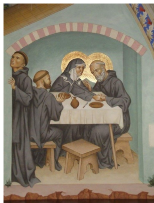
Lost Fresco, Norcia Refectory